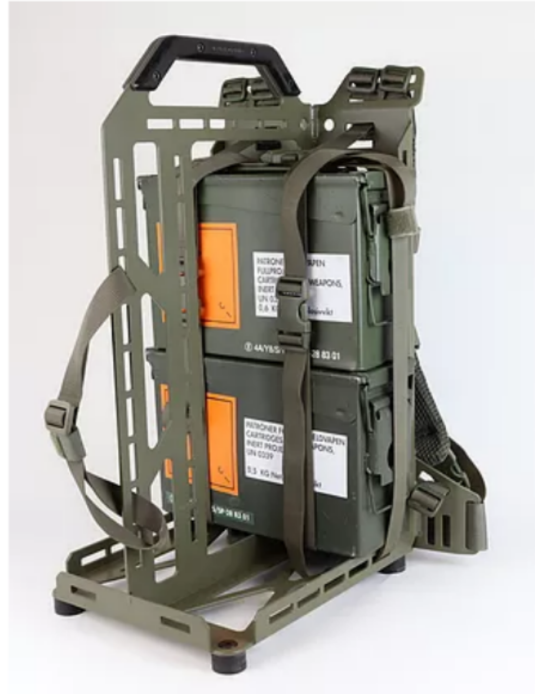
Carry two ammo boxes M19A1 with heavy content.