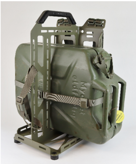
Carry one 20 liter jerrican.