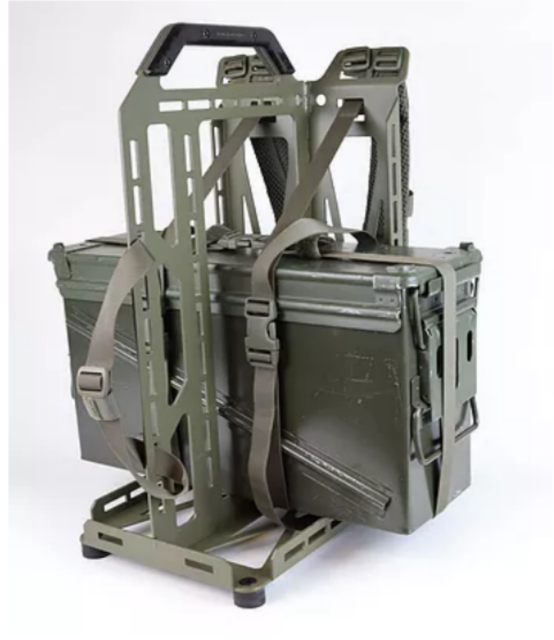
Carry one PA120 box for 40 mm linked ammo.