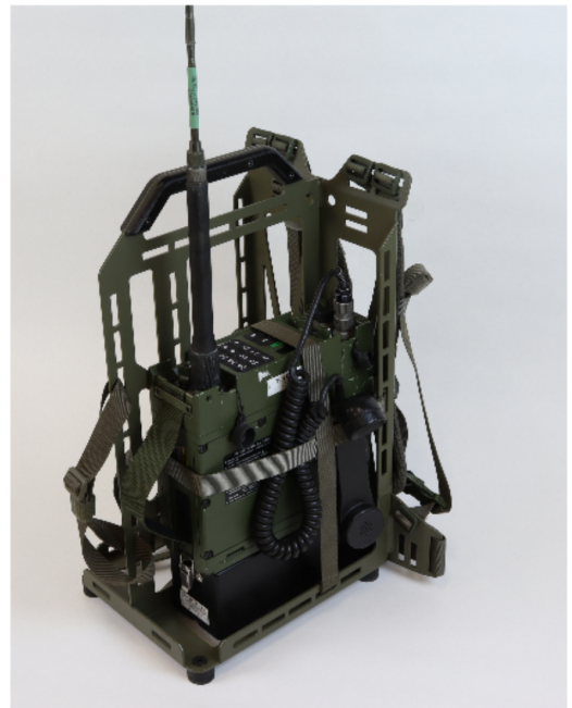
Carry a radio set with accessory bag.