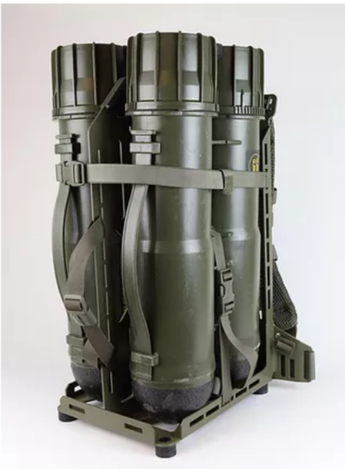
Carry two twin container 84 mm Carl Gustav ammunition tubes.