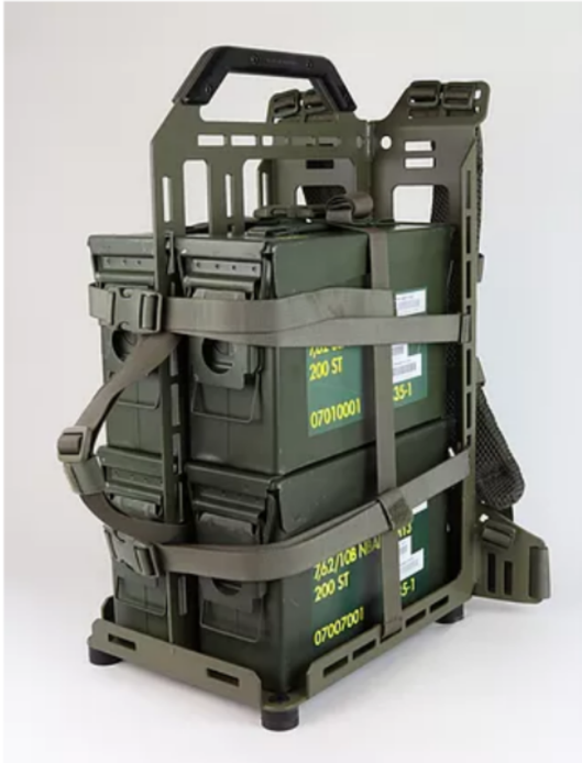
Carry four ammo boxes M19A1 with light content.