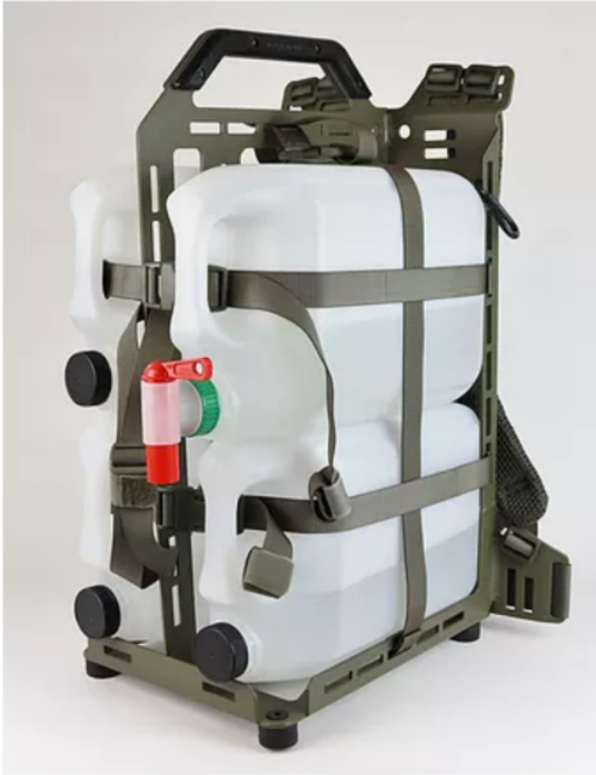
Carry four 5 liter plastic cans of water, in all 20 liter of beverages. Here one is fitted with a tap