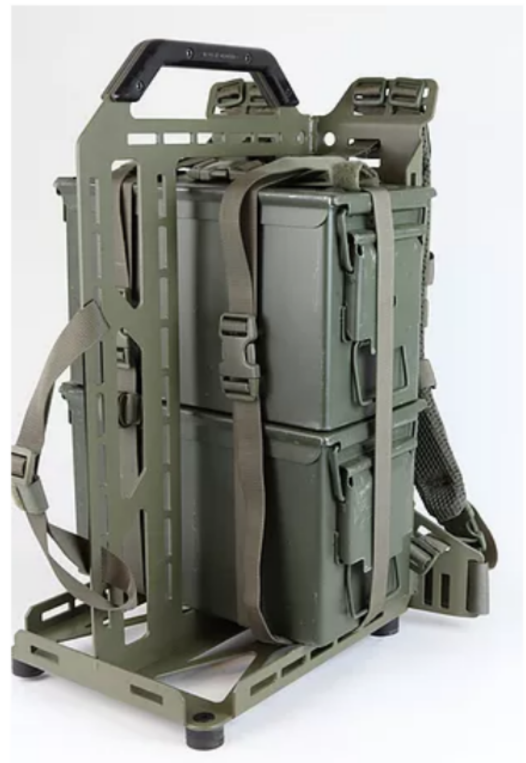
Carry two M2A1 boxes with light content.