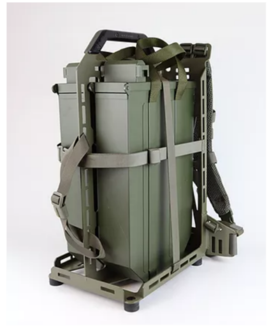
Carry two ammoboxes with total 1000 rds 7.62 mm or 1600 rds 5.56 mm.