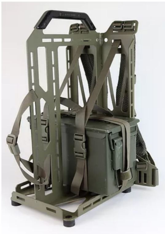
Carry one M2A1 box with heavy content.