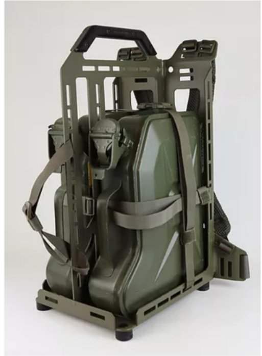
Carry two 5 liter gasoline cans.