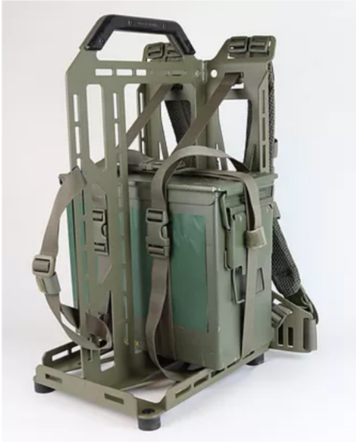
Carry one PA108 box.